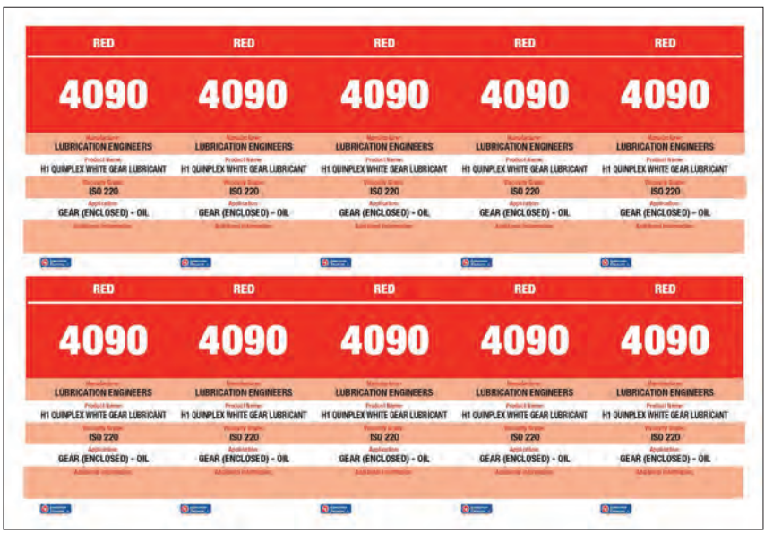
Xpel<sup>™</sup> Label Sheet (example)

In addition to its Xpel<sup>™</sup> tags and labels for lubricant ID, LE offers customized, cost-effective Lubrication Reliability Programs that encompass lube rooms, filtration, oil transfer containers and much more.