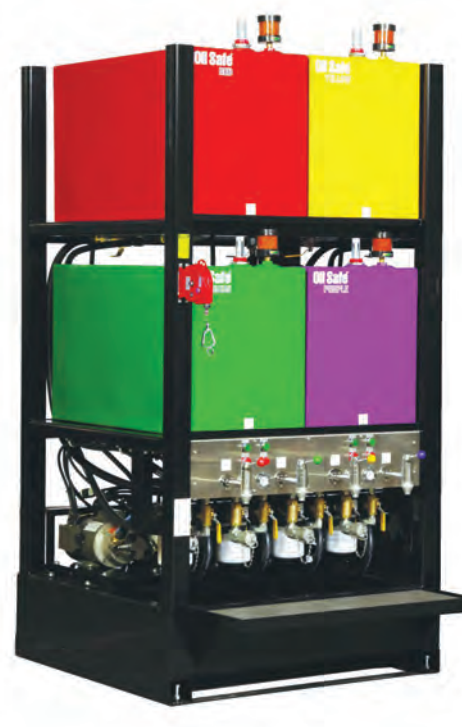
Xpel<sup>™</sup> Lube Room Storage

Xpel<sup>™</sup> Plastic ID Tags (blank)